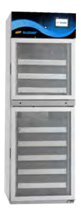
MOTHER MILK REFRIGERATOR AND FREEZERS -20°C +4°C