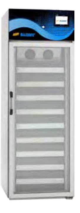
MOTHER MILK REFRIGERATORS +4°C