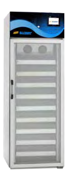
MOTHER MILK FREEZERS -20°C