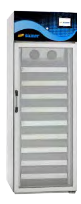
MEDICAL REFRIGERATORS +4°C